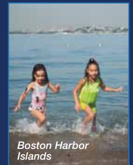
Boston Harbor Islands