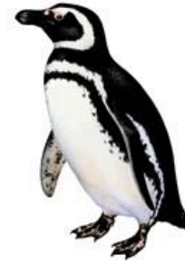
Magellanic Spheniscus magellanicus