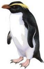
Fjordland Eudyptes pachyrhynchus