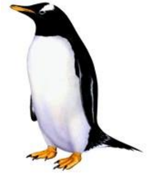
Gentoo Pygoscelis papua