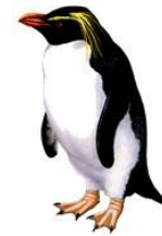
Northern Rockhopper Eudyptes moseleyi