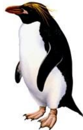
Macaroni Eudyptes chrysolophus