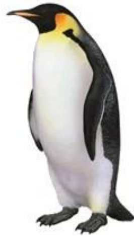
Emperor Aptenodytes forsteri