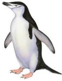
Chinstrap Pygoscelis antarctica