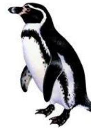
Humboldt Spheniscus humboldti