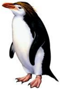
Royal Eudyptes schlegeli