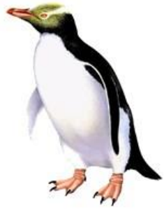
Yellow-Eyed Megadyptes antipodes