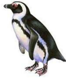
African Spheniscus demersus