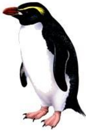
Snares Eudyptes robustus