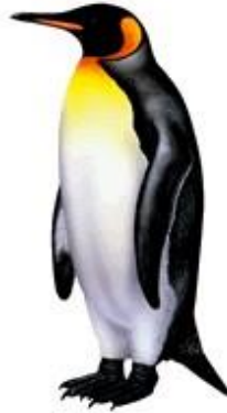
King Aptenodytes patagonicus