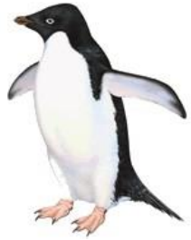
Adélie Pygoscelis adeliae