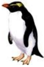
Southern Rockhopper Eudyptes chrysocome