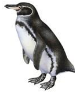
Galápagos Spheniscus mendiculus