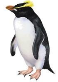
Erect-Crested Eudyptes sclateri