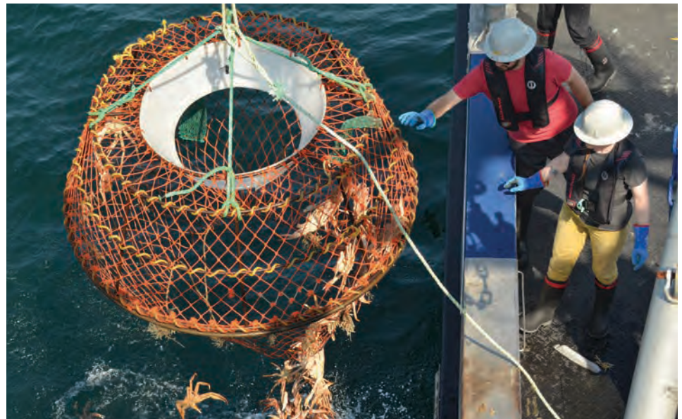
After receiving permission from DFO, the catch of a lost snow crab trap was released before hauling the gear aboard the J.D. Martin and returning it to shore.

After two weeks off and a couple of crew swaps, our second research cruise pushed off the dock on August 4. Unfortunately, the August leg struggled a bit more due to weather and equipment issues, but was still eventful. We quickly noticed an interesting shift in our sightings between the two cruises. In July, we had found that right whales were forming larger aggregations within the Shediac Valley, particularly around a bit of deeper water in the northern section known as "The Hole." In August, we encountered fewer right whales overall and they were more spread out along the edges of the Shediac Valley, but we did have more sightings of other species, including minke, fin, and humpback whales as well as Atlantic white-sided dolphins. There were also lots of birds throughout, including a