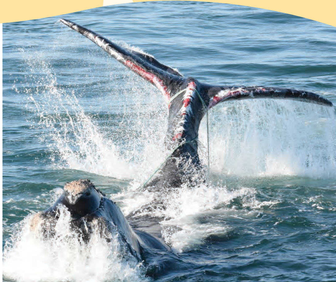
Catalog #4615 soon after he became entangled. He thrashed around in the gear for hours, but was still entangled the following day. He has not been seen since. Taken under SARA Permit.

Summer Field Work in the Gulf of St. Lawrence Eighteenth Right Whale Mother/Calf Pair Discovered Right Whales Sighted Year-Round in Southern New England Mortality and Entanglement Report Right Whale Management Update Team Transitions Sponsored Whale Update Passages Prescott Technology Conservation Fund Holiday Gift Ideas