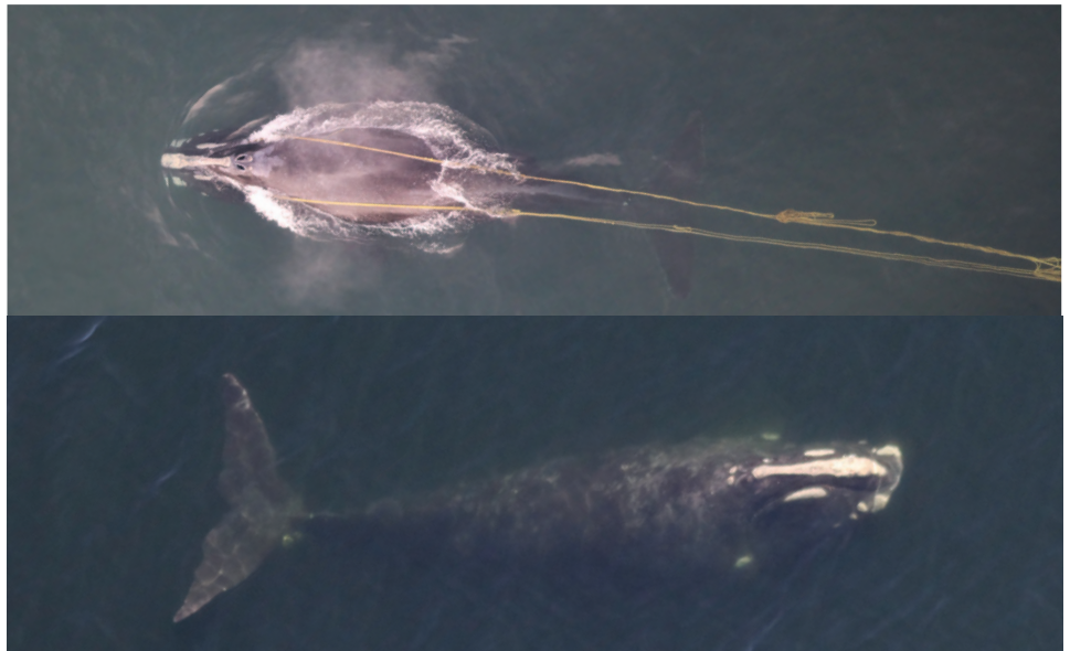
Catalog #3466 entangled in 2019 (top) and free of gear in 2021. NOAA Permit #21371.

Catalog #4615 (5-year-old male): This past summer, researchers and filmmakers in the Gulf of St. Lawrence came across this newly entangled whale.